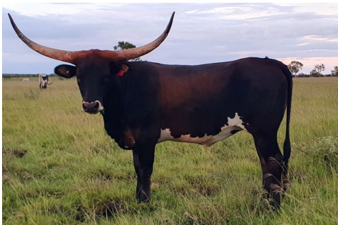
Horseshoe B Texas Longhorns

Full Blood Heifer. Reg# ITLA 287861, TLA HBLTF2129 DOB: 23-2-21