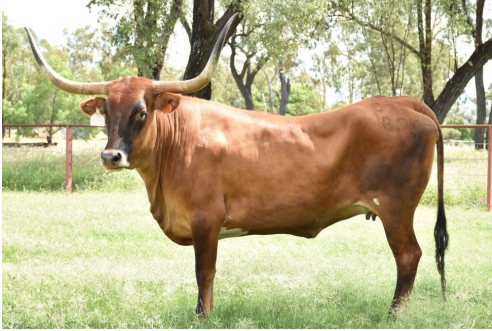
D 7 Spur Texas Longhorns

Full Blood Cow. ITLA Reg #280592 TLA Reg # D7STF1820 DOB: 02/02/2018