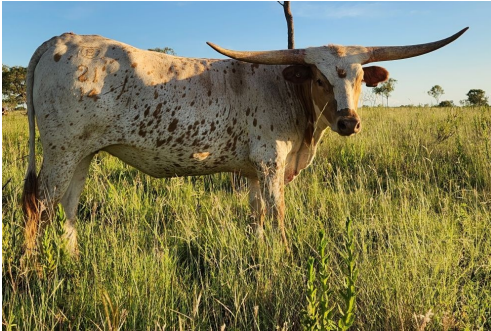
Horseshoe B Texas Longhorns

Heifers like this don't come along too often and Jane Dee is an opportunity worth waiting for. Packed full of Dickinson Cattle Co (USA) genetics this is definitely the opportunity to add a world class female to your herd. She is a very well grown, very hands on gentle and is the complete Texas Longhorn package. Her Drag Iron mother JULEE JANE a super producer and one of the most striking & outstanding Texas Longhorns ever bred in Australia. Her sire is CUT 'N DRIED - a son of Guinness World holder Cowboy Tuff Chex. Jane Dee has been pregnancy tested positive to USA sire SAM CHEX 708 - 2017, 2018, 2019 and 2020 TLBAA Horn Showcase tip to tip champion as well as 2018 bull Alley Champion. Jane Dee is a good a heifer that we have ever offered for sale at Trails West and it will be a proud moment for us to see her go to a new home.