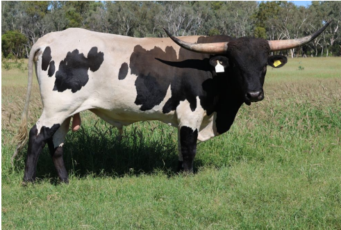
D 7 Spur Texas Longhorns

Full Blood Bull. ITLA Reg # 287965 TLA Reg # D7STFR89 DOB: 10/12/2020.