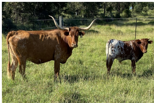
Brigalow Texas Longhorns

Full Blood Cow. Reg# TLATF505 ITLA:283619 TLBAA:C1299878 DOB: 08/04/2015