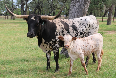
D 7 Spur Texas Longhorns

Full Blood Cow. ITLA Reg # 279075 TLA Reg # D7STF1577 DOB: 08/07/2015