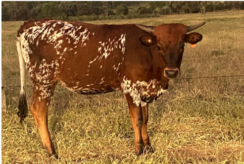
Brigalow Texas Longhorns

Full Blood Heifer. Reg# ITLA 290179 TLA # WHOTF011 DOB: 03/04/2022