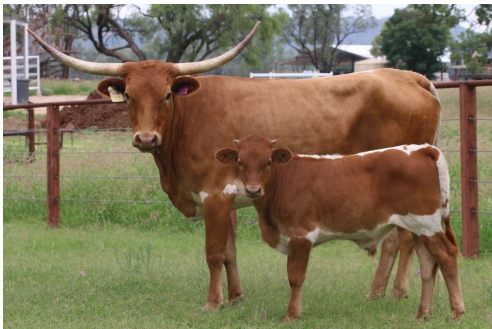
D 7 Spur Texas Longhorns

Full Blood Cow. ITLA Reg # 286563 TLA Reg # D7STFR16 DOB: 01/05/2020