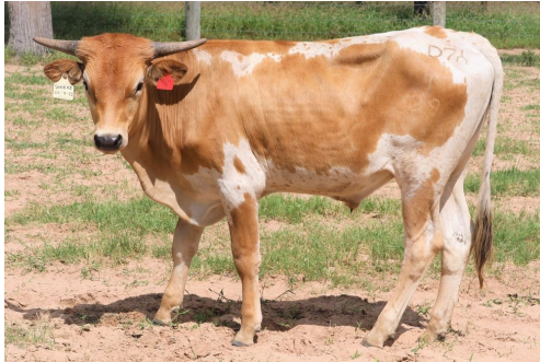
D 7 Spur Texas Longhorns