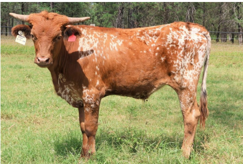
D 7 Spur Texas Longhorns