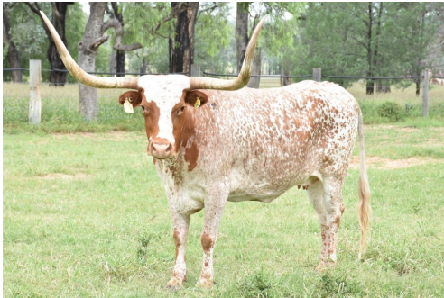
D 7 Spur Texas Longhorns

Full Blood Cow. ITLA Reg # 268466 TLA Reg # D7STF368 DOB: 26/09/2013