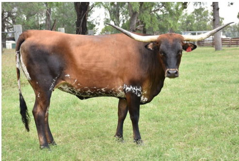
D 7 Spur Texas Longhorns

T4 COW. TLA Reg # D7ST41735 DOB: 04/11/2017