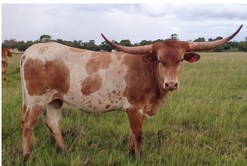
Horseshoe B Texas Longhorns

Full Blood Heifer. Reg# ITLA 287859, TLA HBLTF2127 DOB: 17-2-21