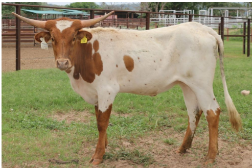
D 7 Spur Texas Longhorns

T4 Heifer. TLA Reg #D7ST4S59 DOB: 02/11/2021