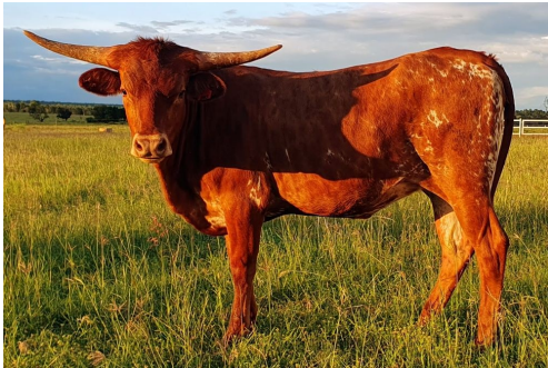
Horseshoe B Texas Longhorns

Full Blood Heifer. Reg# ITLA 290130, TLA HBLTF2213 DOB: 1-1-22