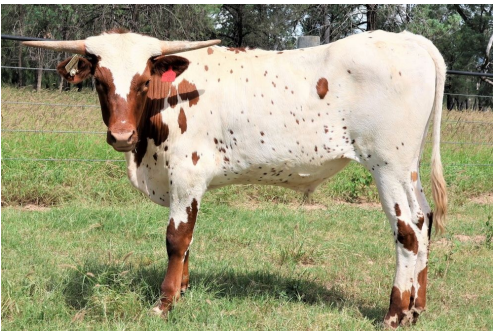
D 7 Spur Texas Longhorns