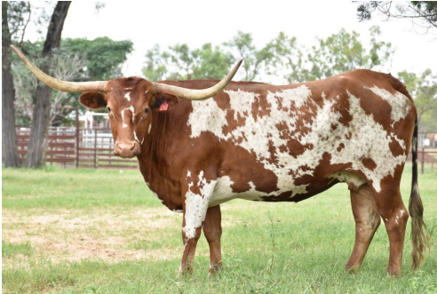
D 7 Spur Texas Longhorns

T3 COW. TLA Reg # HBLT366 DOB: 30/01/2016