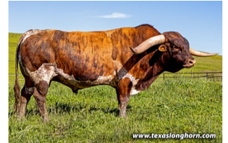
CUT'N DRIED—1 Heifer Sexed