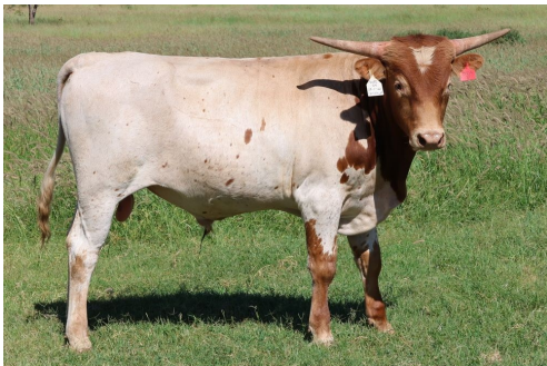
D 7 Spur Texas Longhorns

Full Blood Bull. ITLA Reg # Pending TLA Reg # D7STFT17 DOB: 29/01/2022