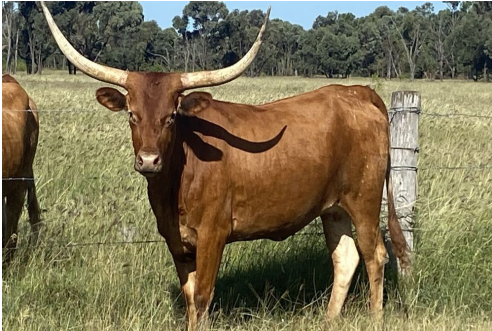
Brigalow Texas Longhorns

Full Blood Heifer. Reg# TLA: WHOTF004 ITLA:283834 DOB: 24/02/2020