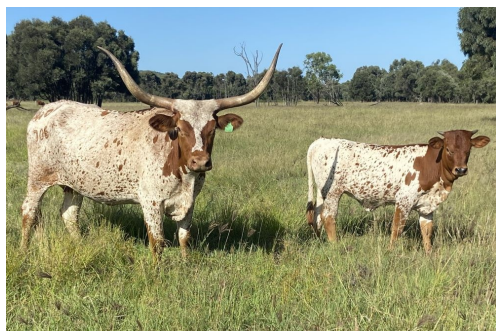
Brigalow Texas Longhorns

Full Blood Cow. Reg# TLA: WHOTF706 ITLA: