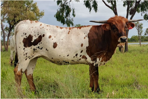
Horseshoe B Texas Longhorns

Kendra is a super pretty and colourful heifer of LONESOME ME who is typically a good colour producer. Just like her mother, she will grow into a nice big cow and carries those black horn genetics from her great USA sire SPOKESMAN.