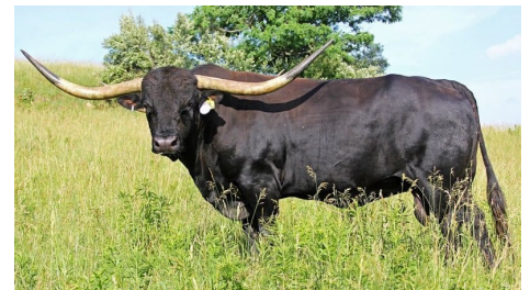
JET BLACK CHEX - 3 straws