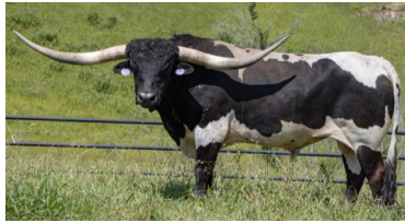
LINE UP - 2 straws