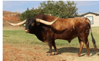
50 AMP - 2 straws