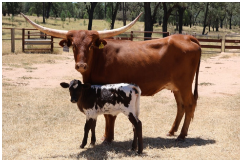
D 7 Spur Texas Longhorns

A very quiet young heifer who's sire has the most impeccable temperament, she has good horn growth as a 2 year old. Renatta has been handled and tied up at weaning.