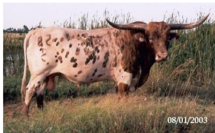
COWBOYMAN - 3 straws