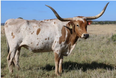
D 7 Spur Texas Longhorns

Full Blood Cow. ITLA Reg #272907 TLA Reg # D7STF462 DOB: 22/11/2014