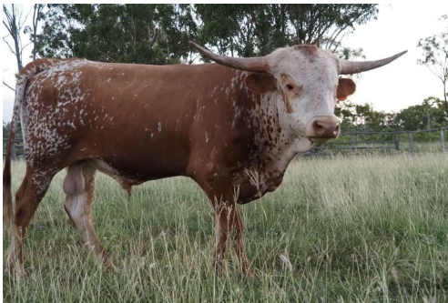
Brigalow Texas Longhorns

Full Blood Bull. Reg# TLA: WHOTF01 ITLA: 290182 DOB: 1/10/21