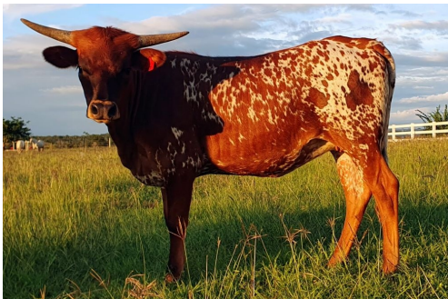
Horseshoe B Texas Longhorns

Full Blood Heifer. Reg# ITLA 290125, TLA HBLTF2224 DOB: 1-3-22