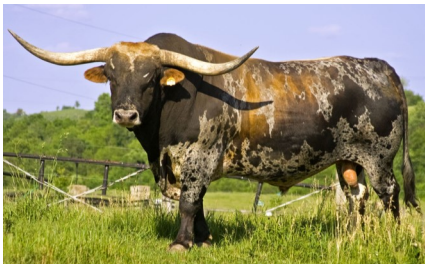
VICTORY LAP - 4 straws

10 straws consisting of the following bulls: