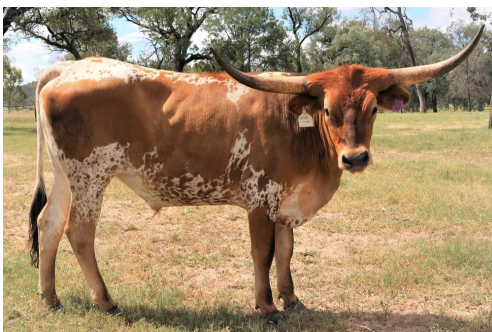
D 7 Spur Texas Longhorns