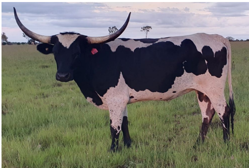
Horseshoe B Texas Longhorns

Full Blood Heifer. Reg# ITLA 287856, HBLTF2117 DOB: 4-1-21