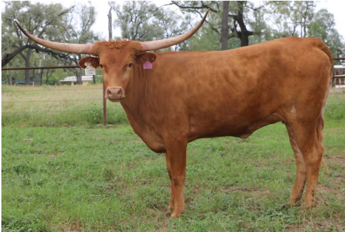
D 7 Spur Texas Longhorns

Full Blood Heifer. ITLA Reg # 287960 TLA Reg # D7STFR76 DOB: 9/12/2020