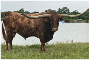
SAM CHEX - 5 straws

10 straws consisting of the following bulls: