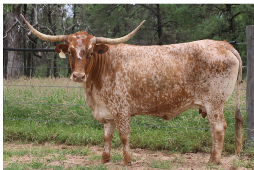
D 7 Spur Texas Longhorns

Full Blood Cow. ITLA Reg #287970 TLA Reg # D7STF1612 DOB: 17/01/2016