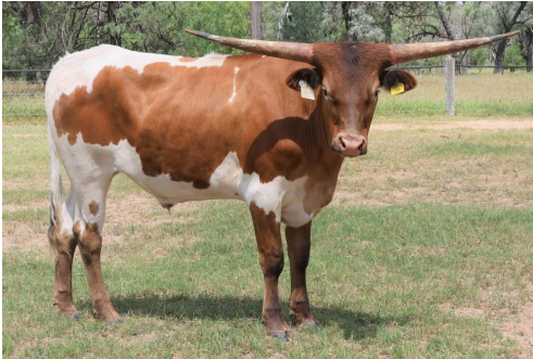
D 7 Spur Texas Longhorns