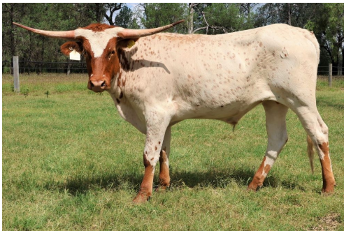
D 7 Spur Texas Longhorns