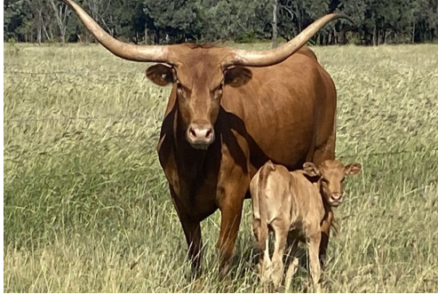
Brigalow Texas Longhorns

T5 Cow. Reg# TLA WHOT5910 DOB: 19/10/2019