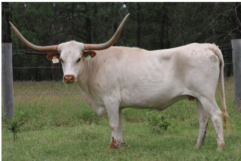
D 7 Spur Texas Longhorns

Full Blood Cow. ITLA Reg #279084 TLA Reg # D7STF1563 DOB: 23/11/2015