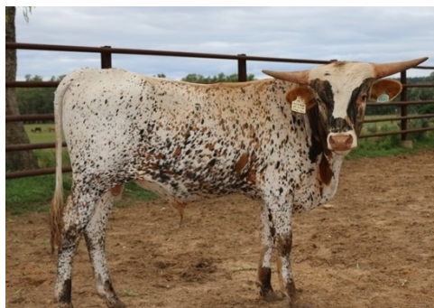
D7Spur Texas Longhorns

Full Blood Bull ★ ITLA Reg# pending ★ DOB: 27-11-15