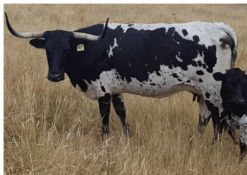
Cowboy Cattle Company

T5 Cow ★ TLA Reg# CCCT51009 ★ DOB: 22-10-09