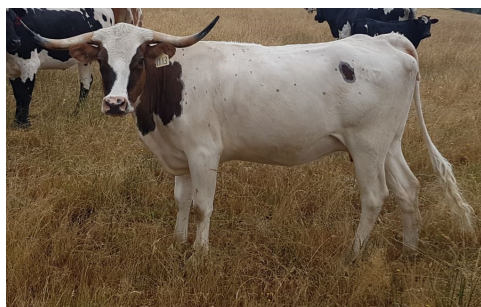
Cowboy Cattle Company

T5 Heifer ★ TLA Reg# CCCT51113 ★ DOB: 1-9-13