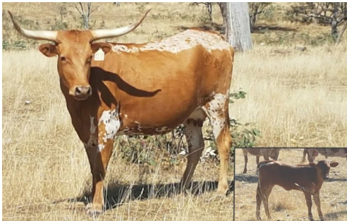
Cowboy Cattle Company

Purebred Cow with heifer calf ★ TLA Reg# CCCTP1213 ★ DOB: 1-9-13