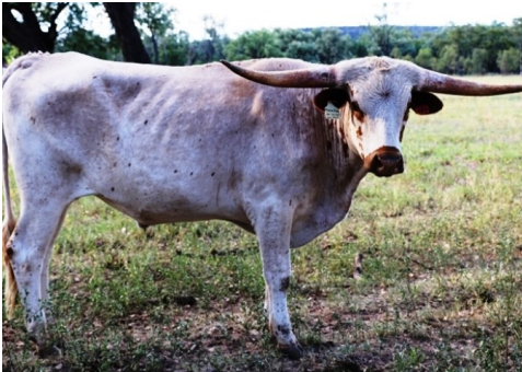
D7Spur Texas Longhorns