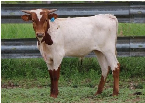
D7Spur Texas Longhorns

Time Event Steer ★ DOB: 12-14 months old