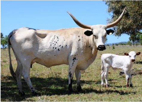
D7Spur Texas Longhorns

Full Blood Cow (& bull calf) ★ TLA Reg # D7STF153 ITLA Reg# 260342 ★ DOB: 14-11-11