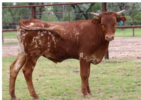
D7Spur Texas Longhorns

Time Event Steer ★ DOB: 12-14 months old