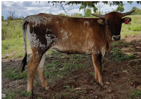
Horseshoe B Longhorns

Full-blood Heifer ★ ITLA Reg# 273228 ★ DOB: 18-2-16