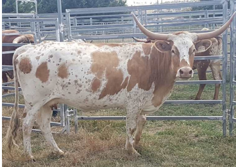
Cowboy Cattle Company

T5 Cow ★ TLA Reg# CCCT51912 ★ DOB: 1-10-12