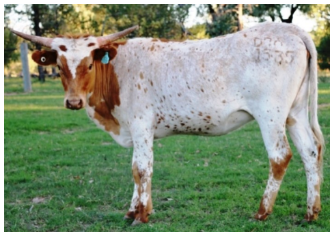
D7Spur Texas Longhorns

T5 Heifer ★ TLA Reg pending ★ DOB: 14-11-15