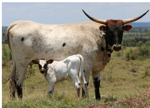
D7Spur Texas Longhorns

Full Blood Heifer (with Bull Calf) ★ ITLA Reg pending ★ DOB: 16-10-14