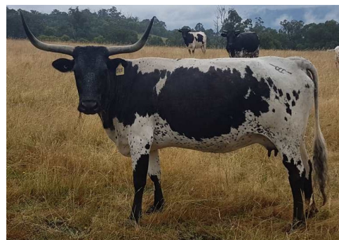
Cowboy Cattle Company

T5 Cow ★ TLA Reg# CCCT50708 ★ DOB: 1-10-08