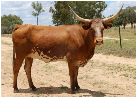
D7Spur Texas Longhorns

Full Blood Cow ★ TLA Reg # D7STF231 ITLA Reg # 260346 ★ DOB: 16-3-12