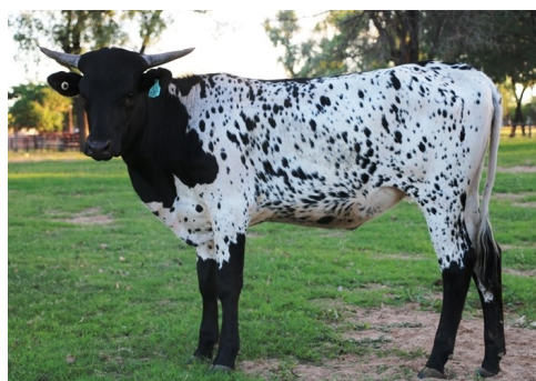
D7Spur Texas Longhorns

T5 Heifer ★ TLA Reg pending ★ DOB: 2-12-15