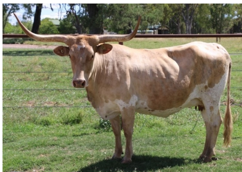
D7Spur Texas Longhorns

T3 Cow ★ TLA Reg# D7ST3109 ★ DOB: 1-7-10