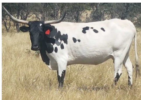
Cowboy Cattle Company

T5 Cow ★ TLA Reg# CCCT51309 ★ DOB: 1-8-09