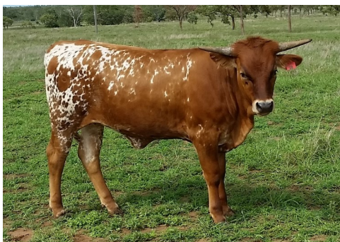
Horseshoe B Longhorns

Full-blood Heifer ★ ITLA Reg# 273227 ★ DOB: 17-2-16