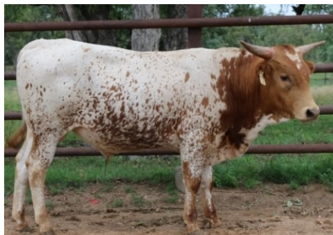
D7Spur Texas Longhorns

Full Blood Bull ★ ITLA Reg # pending ★ DOB: 19-11-15