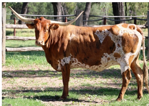
D7Spur Texas Longhorns

T3 Cow (with calf) ★ TLA Reg:# D7ST3024 ★ DOB: 1-7-10