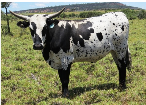
D7Spur Texas Longhorns

T5 Heifer ★ TLA Reg pending ★ DOB: 2-10-15