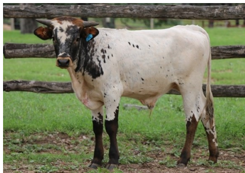
D7Spur Texas Longhorns

Time Event Steer ★ DOB: 12-14 months old