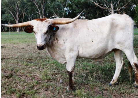
D7Spur Texas Longhorns