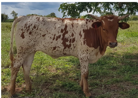
Horseshoe B Longhorns

Full-blood Heifer ★ ITLA Reg# T273236 ★ DOB: 28-3-16