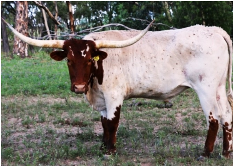
D7Spur Texas Longhorns