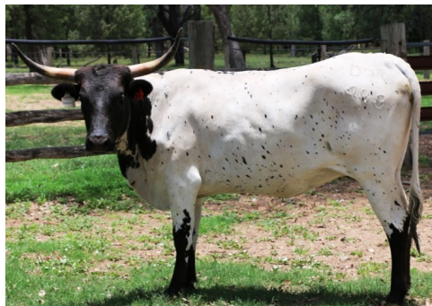
D7Spur Texas Longhorns

Full Blood Heifer ★ ITLA Reg Pending ★ DOB: 20-10-14