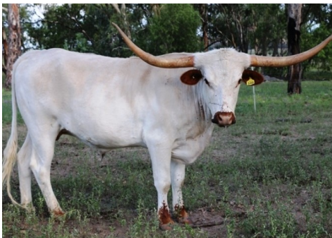
D7Spur Texas Longhorns