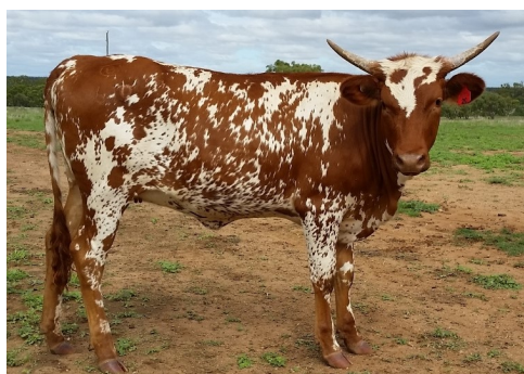
Horseshoe B Longhorns

T5 Heifer ★ TLA Reg# HBLT5610 ★ DOB: 15-2-16