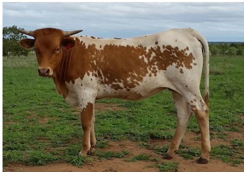
Horseshoe B Longhorns

Full-blood Heifer ★ ITLA Reg# 273223 ★ DOB: 15-2-16