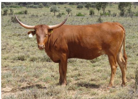
D7Spur Texas Longhorns

Full Blood Cow ★ TLA Reg # D7STF378 ITLA Reg # 268468 ★ DOB: 16-10-13