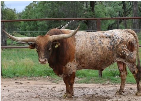
D7Spur Texas Longhorns

Full Blood Bull ★ ITLA Reg# 260339 TLA Reg #D7STF102 ★ DOB: 27-2-11