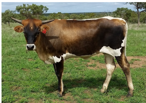
Horseshoe B Longhorns

Full-blood Heifer ★ ITLA Reg# 273201 ★ DOB: 21-1-16